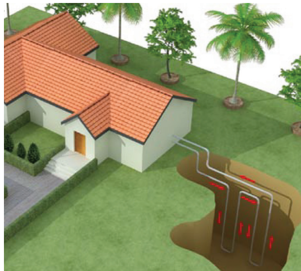
Figure B: Vertical installation of ground source heat pump. Pipes are deep but don't take up as much yard space.

Even though geothermal heat pumps have been around for a long time, the industry is still in its infancy. Expect to see more and more of these systems in the years to come.